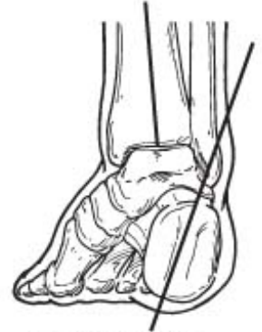
Cavus foot with high arch (rear view)